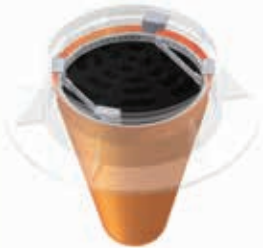
Replaceable Sediment Bag

Lift Handles ease installation and maintenance