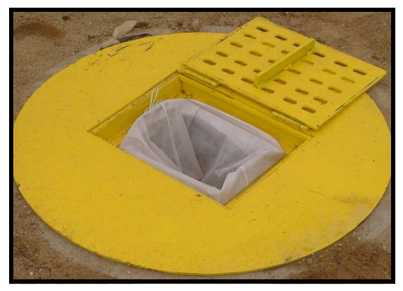
Removable HDPE basket provides for easy cleaning and filter replacement, if necessary.